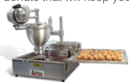
'Cut-N-Fry' (616 with Type N depositor)