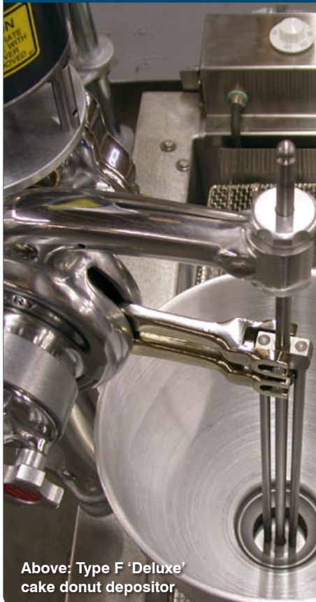
Above: Type F 'Deluxe' cake donut depositor

From Type K handhelds for small fryers, to Type F Deluxe with electric motor and shiny-smooth finish, Belshaw depositors are legendary. And from French Crullers to Greek Loukoumades, there's a selection of plunger styles and sizes to suit just about every taste. Use the depositors shown alongside with the standard fryers shown above.