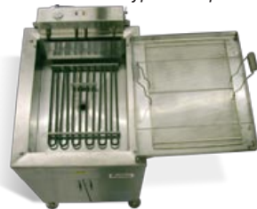
Above: 600 Series Electric Fryers (18", 24" or 34" wide) with Type B