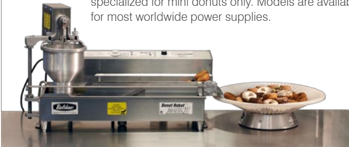
Donut Robot® Mark 2 with Roto-Cooler

Mark 1/2/5 are also available in 'GP' models specialized for mini donuts only. Models are available for most worldwide power supplies.