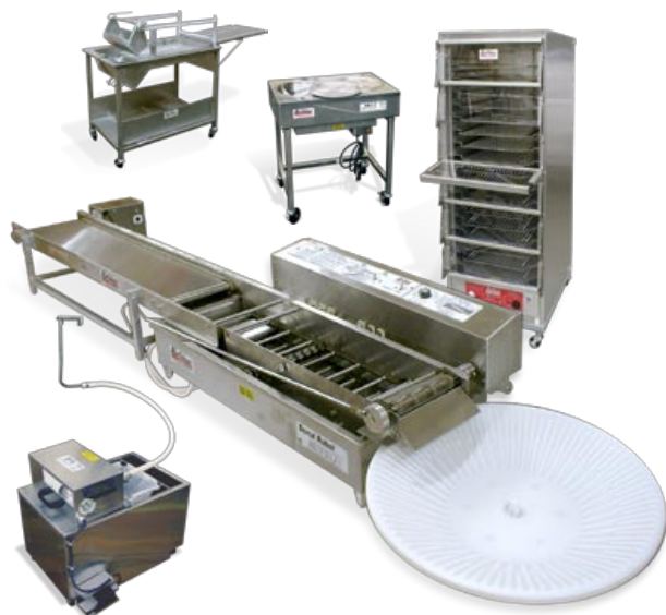
Above: Donut Robot® Mark 2 with proofer, feed table, melter-filter, icer, & glazer – great for both cake and raised donuts