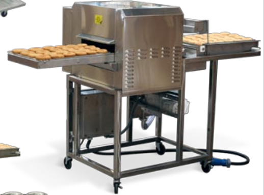
Thermoglaze 50 (50 dozen/hour)