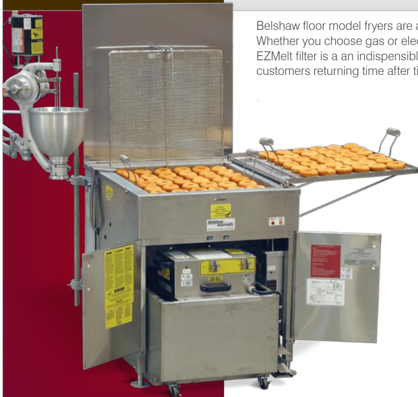
Above: 724G fryer, frying area 24"x24"/61x61cm (with Type F depositor and EZMelt 24 filter and submerger)

Belshaw floor model fryers are available in four standard sizes, for both cake and raised donuts. Whether you choose gas or electric power, a Belshaw fryer with Type B, F or N depositor and EZMelt filter is an indispensable part of producing stand-out quality donuts that will keep your customers returning time after time.