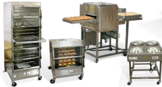
Right: Thermoglaze 50 with two Thermolizers and icer.