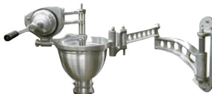
Type N: (for Cut-N-Fry)