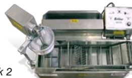
Gas Mark 2