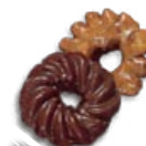
French Cruller/ French Cake