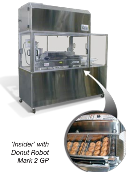
'Insider' with Donut Robot Mark 2 GP

Belshaw's 'Insider' is the only ventless donut center with both fryer and cabinet certified To UL-197, CSA and NSF-4 standards. You can choose between Donut Robot® Mark 2 or Mark 2GP as the fryer for the Insider.