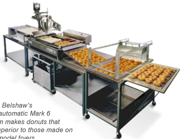
Right: Belshaw's semi-automatic Mark 6 system makes donuts that are superior to those made on floor model fryers