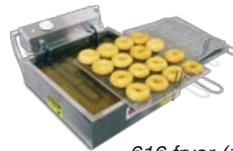
616 fryer (16"x16")