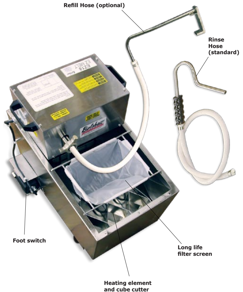
EZ Melt 18 with Rinse Hose (standard) and Refill Hose (optional)