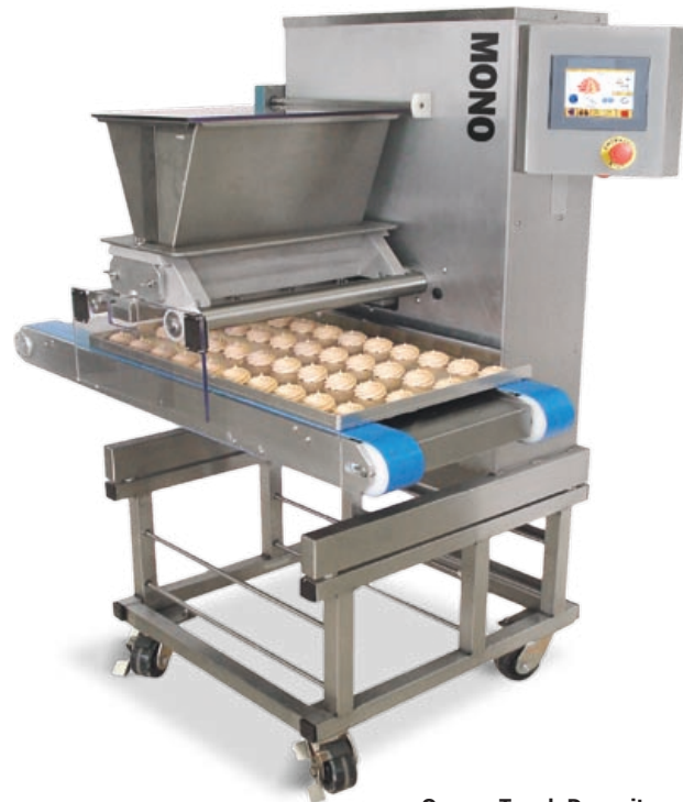
Omega Touch Depositor