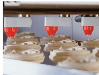
Omega nozzles making swirls