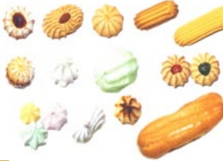
Sample of Omega cookies