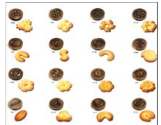
Huge variety of shapes + styles