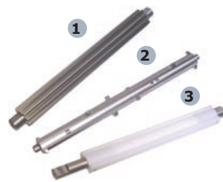
Gears: 1-Standard 2-Intermediate 3-Particulate