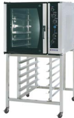
Above: with TrueBake 35E convection oven