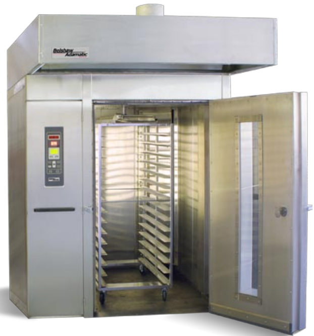
BARO-2G Rack Oven