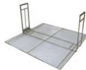
Screen cradle and proofing screen. The best way to transfer raised donuts from proofer to fryer.