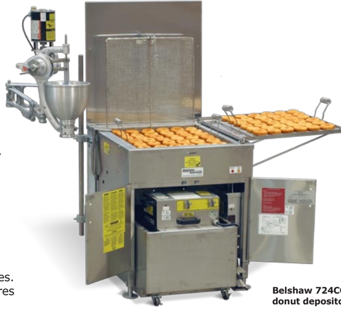
Belshaw 724CG Gas Fryer (with Type 'F' donut depositor, EZ Melt filter and submerger)