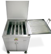
718LCG gas fryer (18" x 26")