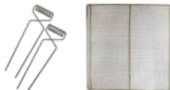
Detachable handles and proofing screen. For cake or raised donuts.