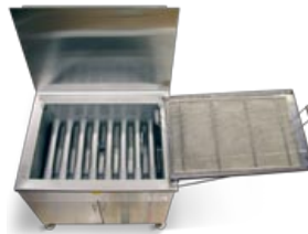
734CG gas fryer (34" x 24")