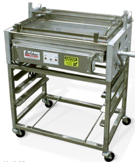
Belshaw HI-18F Floor Model Icer