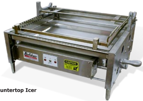
Belshaw HI-18C Countertop Icer

Heavy-duty construction and sound design facilitate cleaning and provide a durable product that will stand up to years of everyday use.