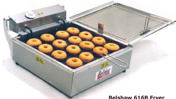
Belshaw 616B Fryer

Tempura makers find the Belshaw 616B's small size, shallow depth and overall simplicity ideal for tempura frying.