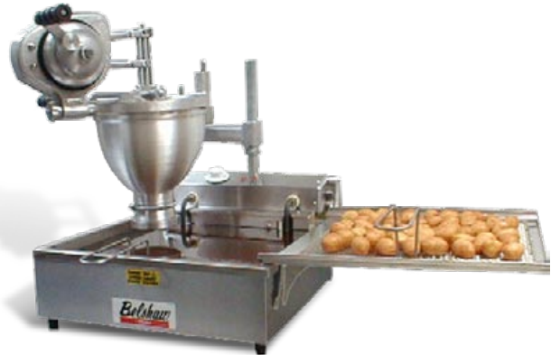
Belshaw 'Cut-N-Fry' for HushPuppy/Loukoumathes