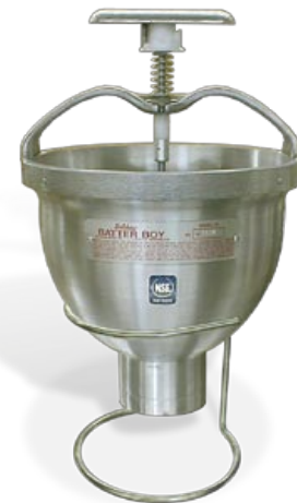
Type 'G' Batter Boy' Depositor