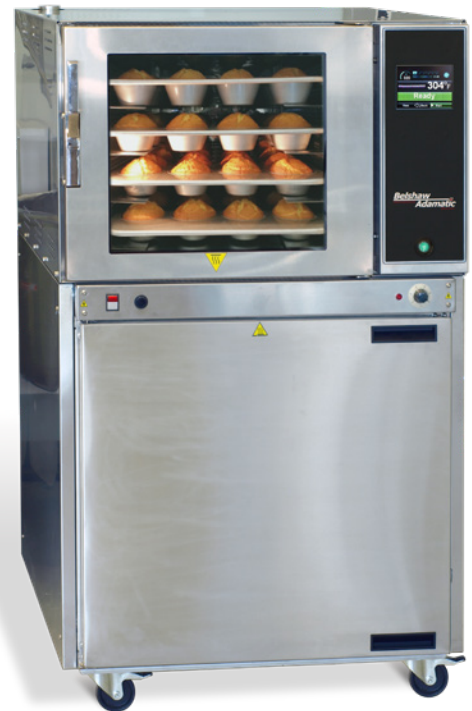
BX Proofer with single BX Eco-touch convection oven