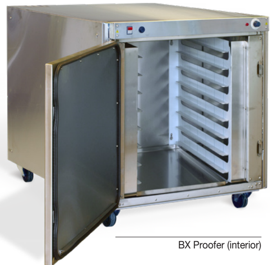
BX Proofer (interior)