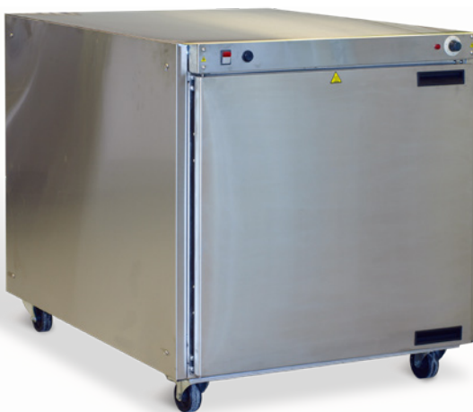
BX Proofer (exterior)